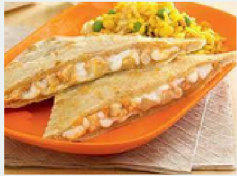
CHICKEN #936400 - 1/96 CT

A golden-brown whole grain pastry crust of pre-cut triangles filled with chicken, creamy mozzarella cheese and sauce (Coyote Grill)