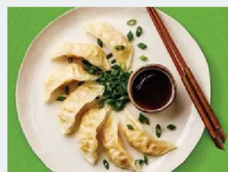
CHICKEN LEMONGRASS ITEM #350801 - 3/2.5 LB

Shrimp Coupled With Chinese Vegetable Folded In Authentic Pastry (Amoy)