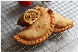
BEEF ITEM #863063- 36/3 OZ

The savory aroma of cooked beef combined with onions, peppers, and a hint of paprika. (Brisas)