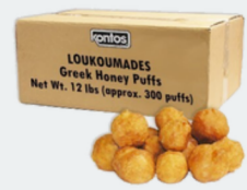
LOUKOUMAES 1/12 LB - 915150