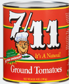
TOMATO GROUND 7/11