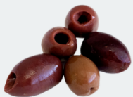
KALAMATA OLIVES PITTED 1/8 LB - 363015