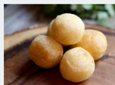
YUCA & CHEESE BITES ITEM #936403 - 1/96 CT

Steak cut Caribbean potatoes. (La Toca Blanca)