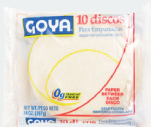
EMPANADA DOUGH WHITE 5" 24/14 OZ - 931004