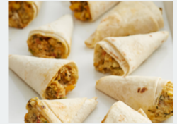
CHICKEN CORNUCOPIA ITEM #851022 - 1/50 CT

A blend of two cheeses, seasoned beef and a salsa style sauce in a fun pizza shape. (The Max)