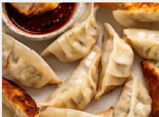
VEGETABLE ITEM #340836 - 150/.8 OZ

Filled with an array of traditional Chinese vegetables that are lightly seasoned and juicy. (Chef One)