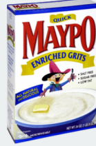
HOMINY 12/24 OZ - 152410