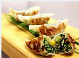
KALE & VEGETABLE ITEM #350805 - 114/1.05 OZ

Clean flavor profile with a blend of whole edamame beans, diced carrots, and corn (vegan). (Chef One)