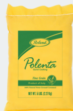
POLENTA YELLOW 4/5 LB - 205046 ROLAND