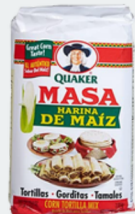
CORN MASA HARINA 8/70.4 OZ - 007826