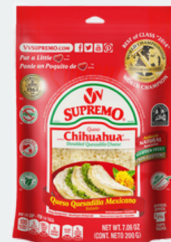
CHEESE CHIHUAHUA SHREDDED 30565 - 4/5 LB