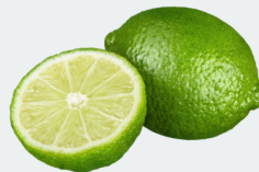
LIMES BUSHEL 1/200 CT - 109890