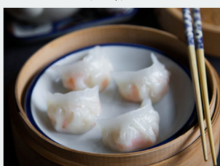
SHRIMP ITEM #683303 - 120/1 OZ

Classic, Chinese-style pork dumplings filled with fresh, crunchy napa cabbage and shiitake mushroom. (Chef One)