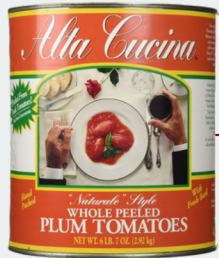
TOMATO PLUM WHOLE