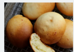
PANDEBONO CHEESE BREAD ITEM #863059 - 50/2 OZ

Twice fried plantains. Pre-fried. (La Toca Blanca)