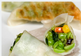
EDAMAME ITEM #340807 - 3/2.5 LB

A refreshing mix of chicken, lemongrass, corn, scallion, onion. (Chef One)