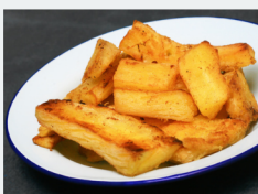
YUCA FRIES #942558 - 12/2.2 LB

filled with red chili-spiced beef, flavorful kettle-cooked beans, and melty cheese wrapped in a soft tortilla. (Global)