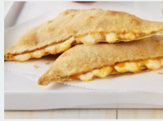
CHEESE ITEM #936403 - 1/96 CT

A golden-brown whole grain pastry crust of pre-cut triangles filled with chicken, creamy mozzarella cheese and sauce (Coyote Grill)