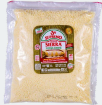
COTIJA GRATED 12/1 LB - 030235