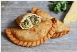
SPINACH AND CHEESE ITEM #863065- 36/3 OZ

The savory aroma of cooked beef combined with onions, peppers, and a hint of paprika. (Brisas)