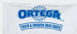
ORTEGA TACO SAUCE PC