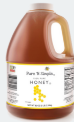
HONEY AMBER 6/5 LB - 500631