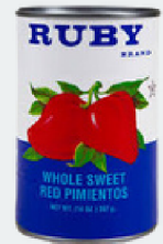
PIMINETOS WHOLE 24/14 OZ - 532401