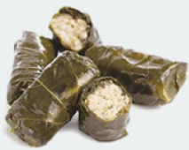
GRAPE LEAVES STUFFED 6/4 LB - 530640