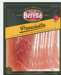
PROSCIUTTO SLICED #141525, 10/1 LB