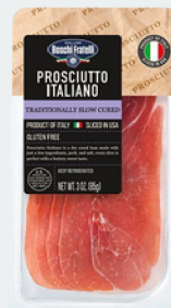
PROSCIUTTO ITALIANO SLICED #231461, 12/3 OZ