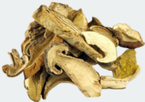
DRY PORCINIS 1/1 LB - 750270 PACKER