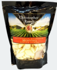
CALIFORNIA PEELED GARLIC 4/5 LB - 080403 CHRISTOPHER RANCH