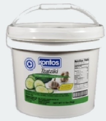
TZATZIKI 4/5 GAL - 080406