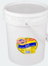
LARD 1/38.5 LB - 007826