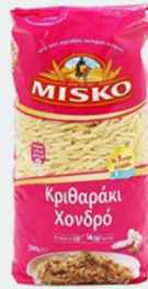
GREEK ORZO 20/500 GR - 372018