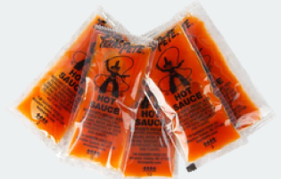
TEXAS PETE HOT SAUCE PC