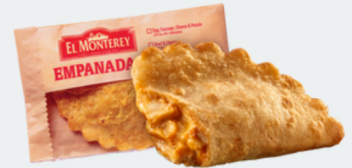
CHICKEN & CHEESE ITEM #965123 - 3/2.5 LB

The chicken is marinated in a blend of herbs and spices. Complemented by sautéed onions, bell peppers, and a touch of cumin. (Brisas)