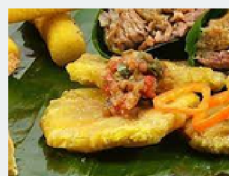
TOSTONES PATACONES ITEM #942559 - 6/3 LB

Cheese infused balls of yuca (cassava) to be served either fried or baked. (Brisas)