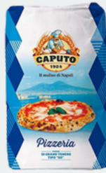
FLOUR DOUBLE ZERO 1/55 LB - 205032 CAPUTO