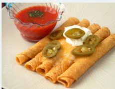
CHICKEN TAQUITOS ITEM #983260- 8/2.06 LB

Each of these white meat chicken taquitos is wrapped in a corn tortilla for delicious flavor. (Delimex)