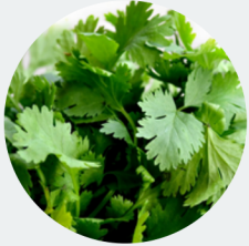
CILANTRO CRATE 1/24 CT - 109722