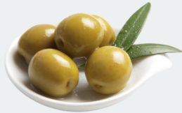
MANZANILLA OLIVE PITTED 4/1 GAL - 130407