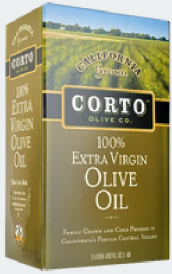
EXTRA VIRGIN OLIVE OIL 1/10 LTR - 350650 CORTO