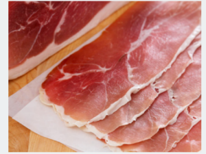
PROSCIUTTO DI PARMA 1/17 LBA - 090565 LEONCINI