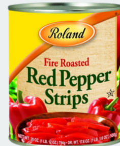
FIRE ROASTED RED PEPPER STRIPS