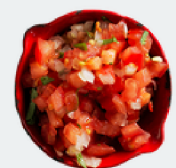
PICO MIX FRESH