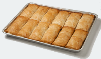
SPANAKOPITA 3/24 CT - 931242