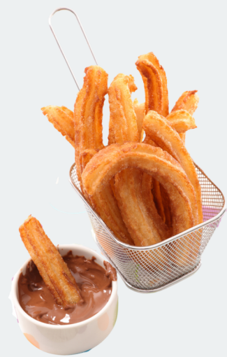
CINNAMON SUGAR CHURRO #932910 - 1/100 CT