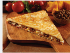
BEEF & CHEESE ITEM #420452 - 96/4.09 OZ

A golden-brown whole grain pastry crust of pre-cut triangles filled with creamy mozzarella cheese and sauce. (Coyote Grill)