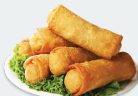
EGG ROLL VEGETABLE MINI ITEM #853018 - 100/.9 OZ

ITEM #997002 - 200/.9 OZ A sweet and savory flavor profile from the combination of coconut cream, shrimp, carrots and peas within a crispy spring roll shell. (Chef One)