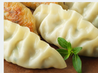
CHICKEN TERIYAKI ITEM #340803 - 150/.8 OZ

A gourmet potsticker made with diced chicken in paper-thin pastry & seasoned with garlic & sesame oil. (Amoy)