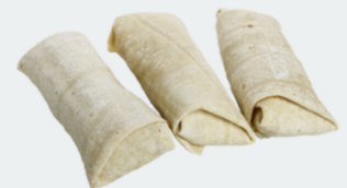
BEEF & BEAN BURRITO WITH CHILI ITEM #730370 - 72/4 OZ

Black beans and cheese wrapped in a tortilla. Individually wrapped. (Cabo Primo)