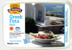
GREEK FETA 1/29 LB - 952572