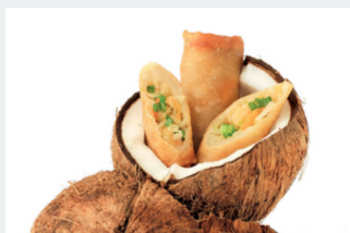
COCONUT SHRIMP SPRING ROLL

Crisp spring rolls filled with a mix of delicious vegetables. (Amoy)