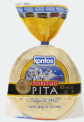
PITA BREAD 12/10 CT - 931201