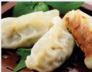
GOURMET CHICKEN ITEM #996474 - 120/.67 OZ

Filled with an array of traditional Chinese vegetables that are lightly seasoned and juicy. (Chef One)