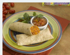
SOUTHWEST BEAN & CHEESE BURRITO ITEM #730273 - 80/6.5 OZ

Mini chicken tacos filled with a savory blend of garden-fresh onions, specs of spicy red chili peppers, and pea-size chunks of tender, juicy chicken, wrapped in a crispy corn tortilla. (Posada)