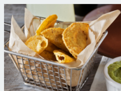
MINI CHICKEN TACOS ITEM #152070 - 4/4 LB

Each of these white meat chicken taquitos is wrapped in a corn tortilla for delicious flavor. (Delimex)