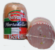
MORTADELLA WITH PISTACHIO