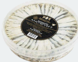
ANCHOVIES IN OIL 4/1 KG - 109598 MARTEL