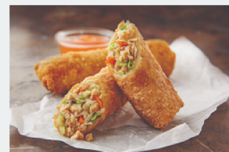
EGG ROLL VEGETABLE ITEM #996445 - 72/3 OZ

Authentic egg roll skin wrapper filled with crispy garden vegetables seasoned with spices and ginger. (Spring Valley)