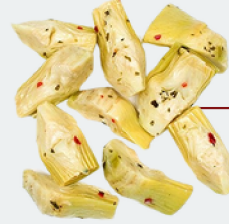
ARTICHOKE HEARTS 40/50 CT