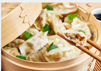
PORK & NAPA CABBAGE ITEM #340805 - 150/.8 OZ

A mix of sweet and savory flavors, with tender and juicy chicken glazed in a perfectly balanced teriyaki sauce. (Chef One)