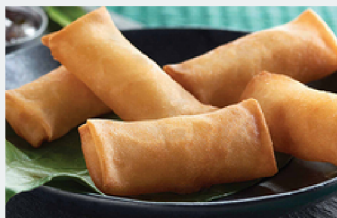
VEGETABLE SPRING ROLL ITEM #851036 - 192/.5 OZ

Crisp spring rolls filled with a mix of delicious vegetables. (Amoy)