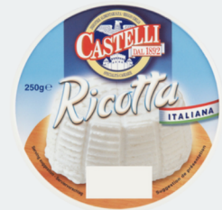
RICOTTA 6/3 LB - 030604 PACKER