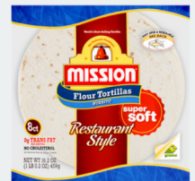
FLOUR TORTILLAS SEE PG. 20 FOR ALL OFFERINGS