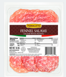
TOSCANO SALAMI W/ FENNEL SEED SLICED #231479, 2/3.5 LB