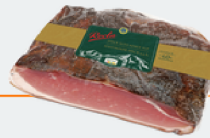
RECLA SPECK ALTO ADIGE