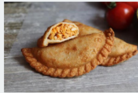
CHICKEN ITEM #863064- 36/3 OZ

Rich and creamy cheese with tender spinach in a golden, flaky pastry shell. (Brisas)