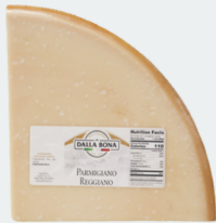
REGGIANO PARMIGIANO 1/18 LB - 090465 DALLA BONNA