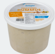
HUMMUS 4/64 OZ - 853014