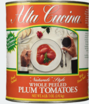
WHOLE PLUM TOMATOES 6/#10 - 520612 ALTA CUCINA