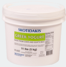
GREEK YOGURT 1/11 LB - 932400