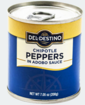
CHIPOTLE PEPPERS IN ADOBO 24/7 OZ - 031060